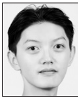
Cecile Wolfe Photography