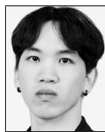
Cecile Wolfe Photography