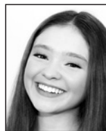
Cecile Wolfe Photography

Happy Holidays and Thank You for Your Support!